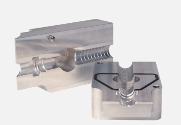
DUCT CLAMP (AVAILABLE IN DIFFERENT SIZES)