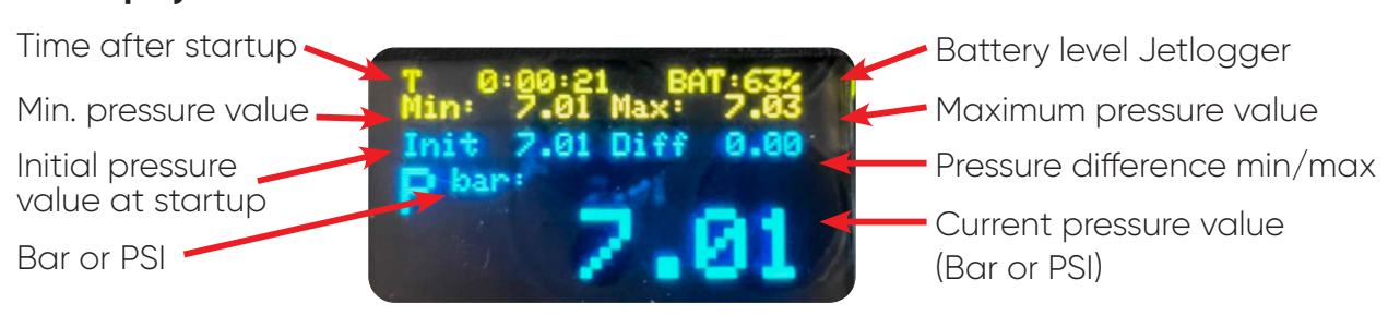
All values will be cleared when you press 'Reset'